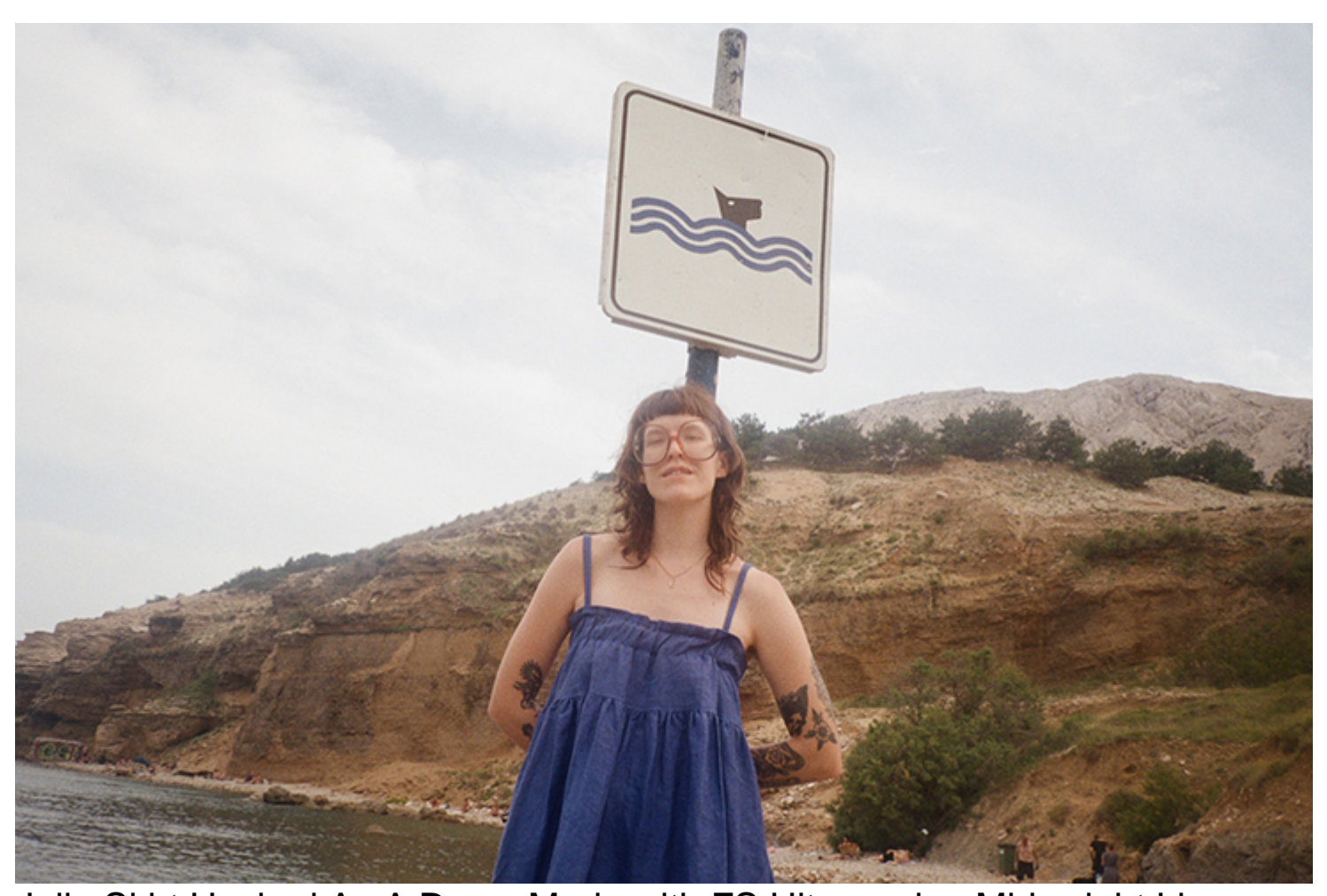
Julia Skirt Hacked As A Dress Made with FS Ultramarine Midweight Linen.